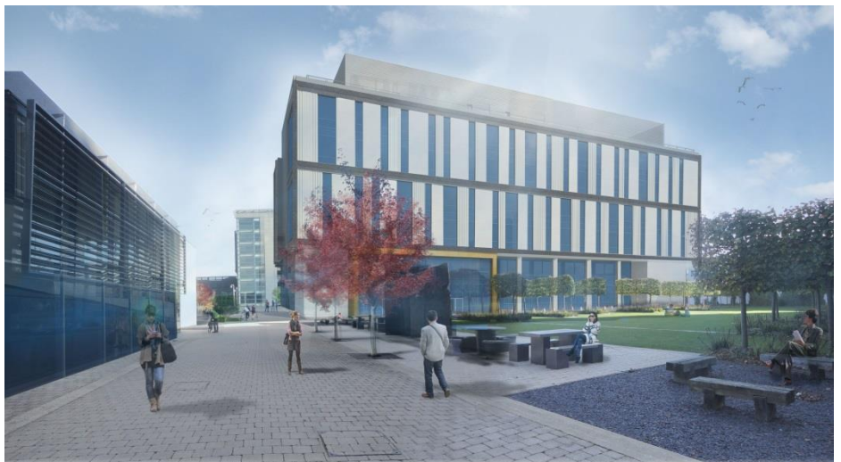
Artist's impression of the new research facility project Capella for the University of Cambridge

After a relaxing Christmas and New Year we look forward to starting where we left off in 2016 and make lots of progress in 2017.